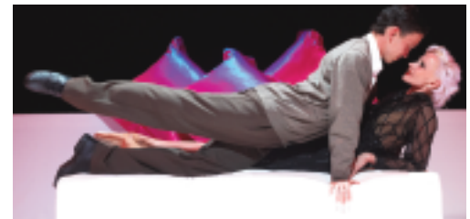
"I knew I belonged to the public and to the world, not because I was talented or even beautiful, but because I had never belonged to anything or anyone else." - Marilyn